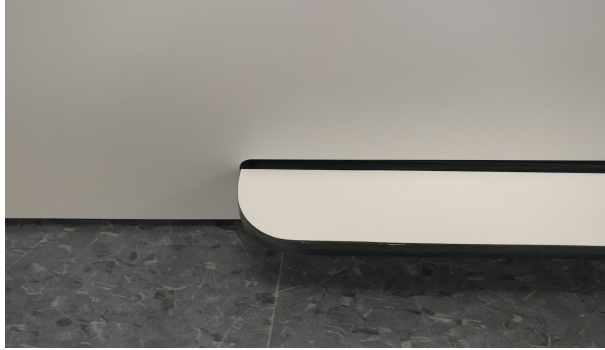
Ensure tabs and slots are aligned to avoid interference

Stand the side panel up with the back edge of the panel facing the floor. Begin to slide the side panel into the slot on the back panel. Have one person slide the panel, while the other person ensures the tabs are aligned with the slots. This is particularly important when the tabs reach the centre of each panel.