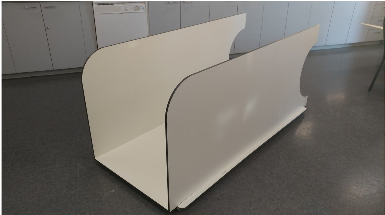
Your Safe Screen should now look like this

Repeat Step #2 with the remaining side panel.