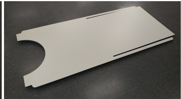
Flip panel over onto foam blocks