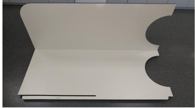
Your Safe Screen should now look like this